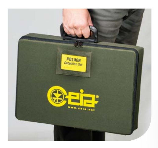
PD140N Hand Held Detection Set with carry bag